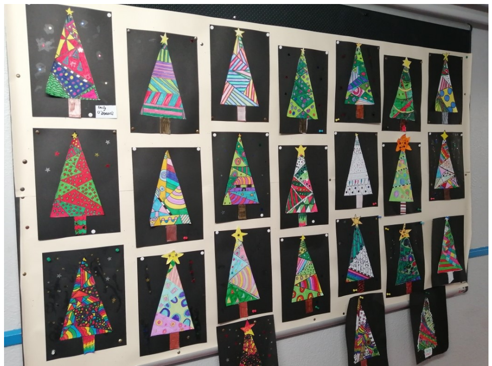
5th & 6th