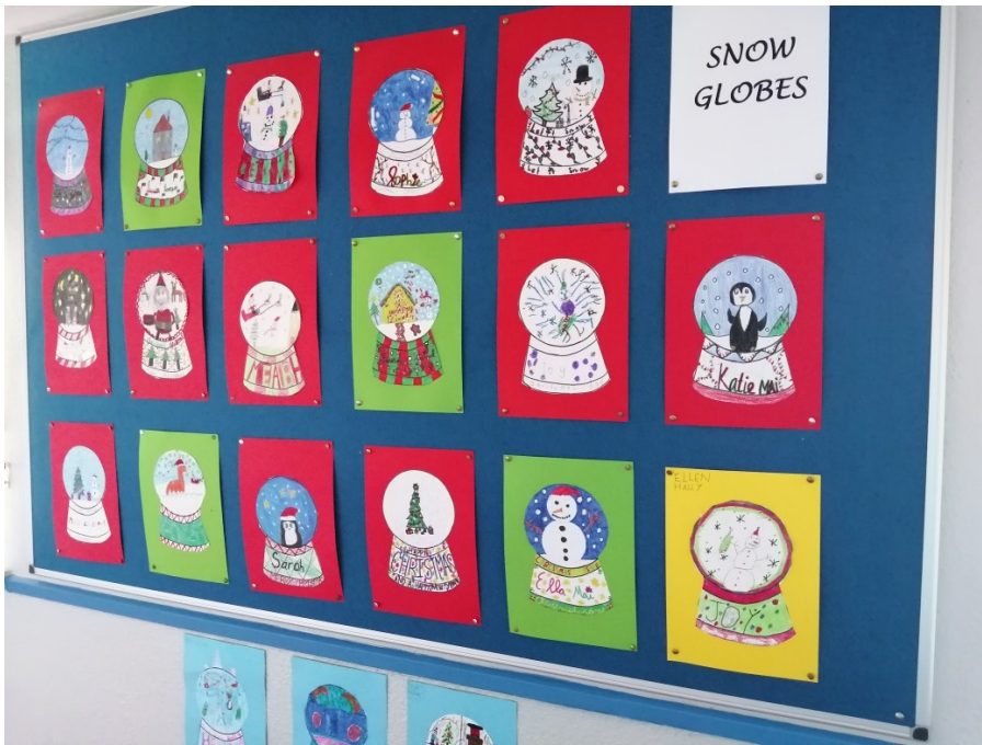
3rd & 4th CLASS