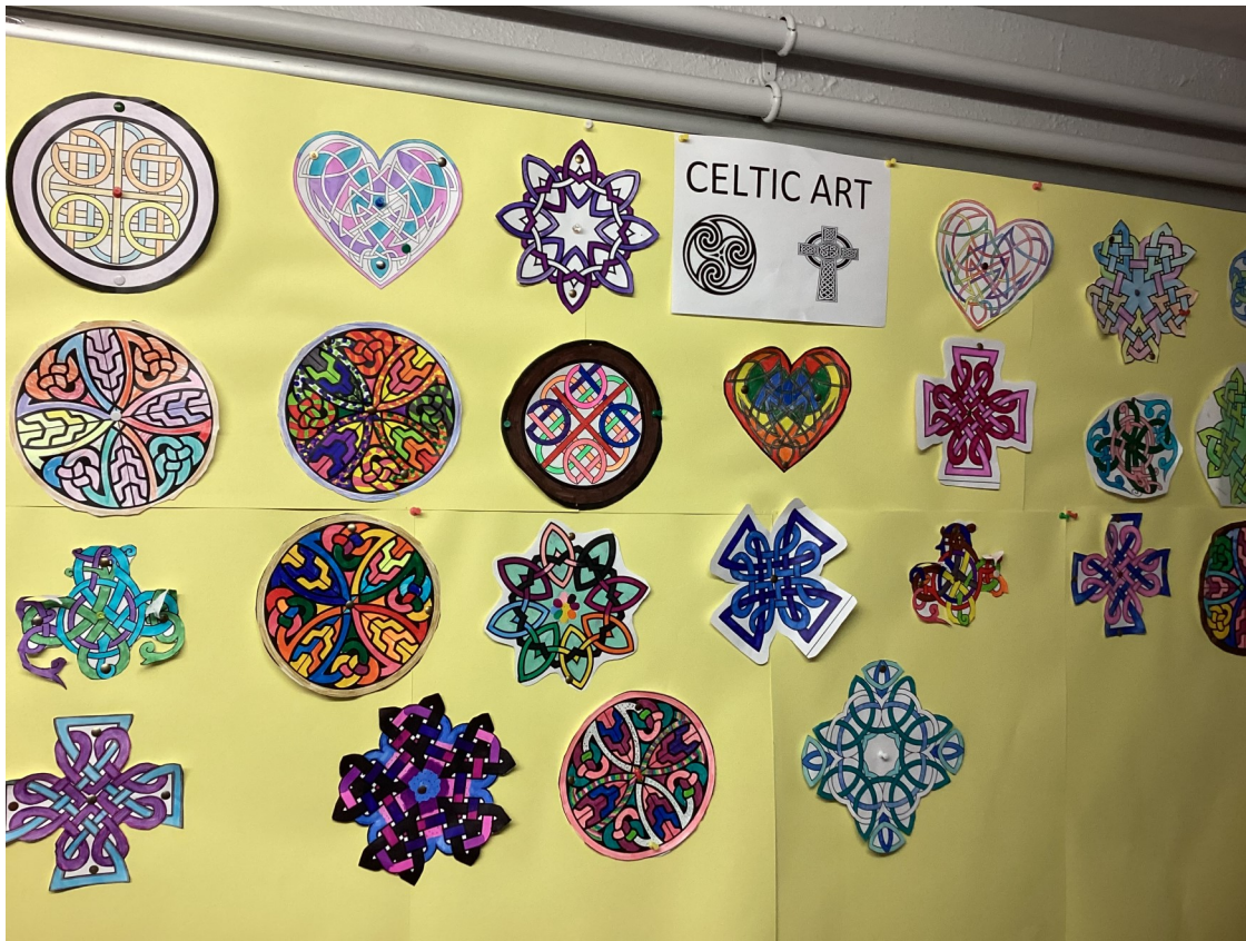
5th & 6th