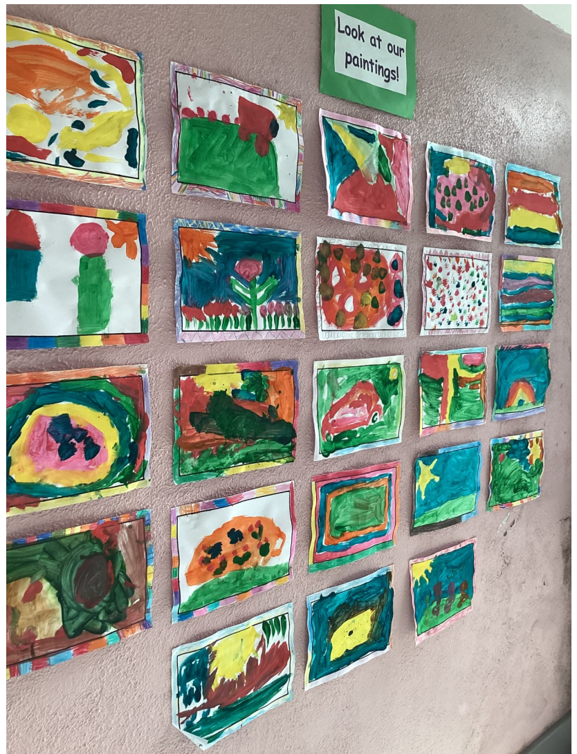
Senior Infants/1st class