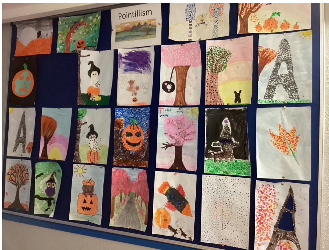
3rd & 4th