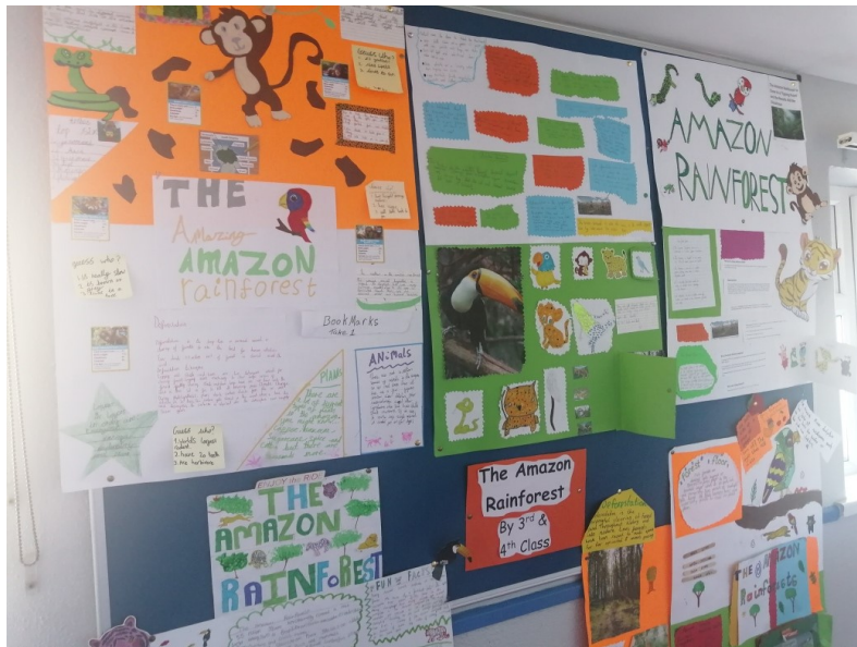
3rd & 4th class Amazon Rainforest