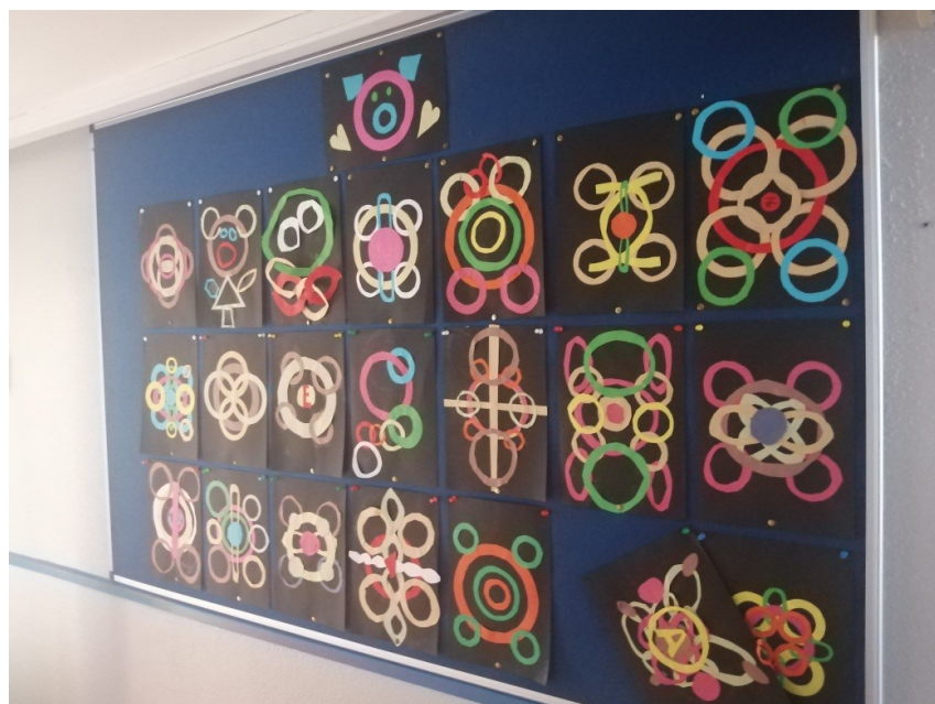
5th & 6th class Modern Celtic Art