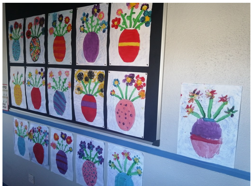
3rd & 4th class