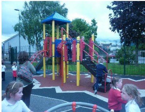
Junior Tour 12/6/13

On Wednesday, 12th June pupils from Junior Infants to 1st Class went to the Sports Complex in Tipperary Town for a great day of fun and activities followed by a trip to the cinema to see the film " Epic "